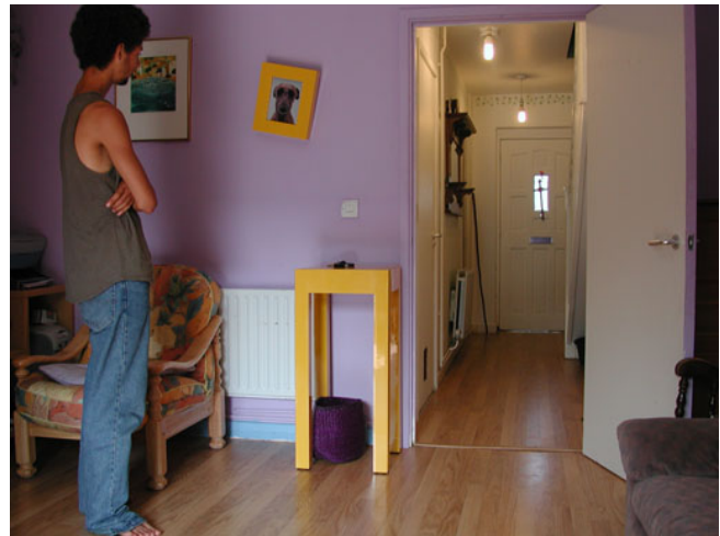
Figure 1: The Key Table

One example of such a system is the Key Table, developed as part of the Equator IRC (Figure 1). The Key Table was designed to support a simple interaction: load sensors supporting the tabletop measure the force with which things are placed on it, and a wirelessly linked picture frame swings out of kilter proportionally to this force. While the behavior of the Key Table is clear – force equals angle of picture frame - how users should make sense of this behavior is not. To see how people would make sense of the Key Table, a volunteer household was recruited to live with it in their home for a month. The target family was mistakenly not told